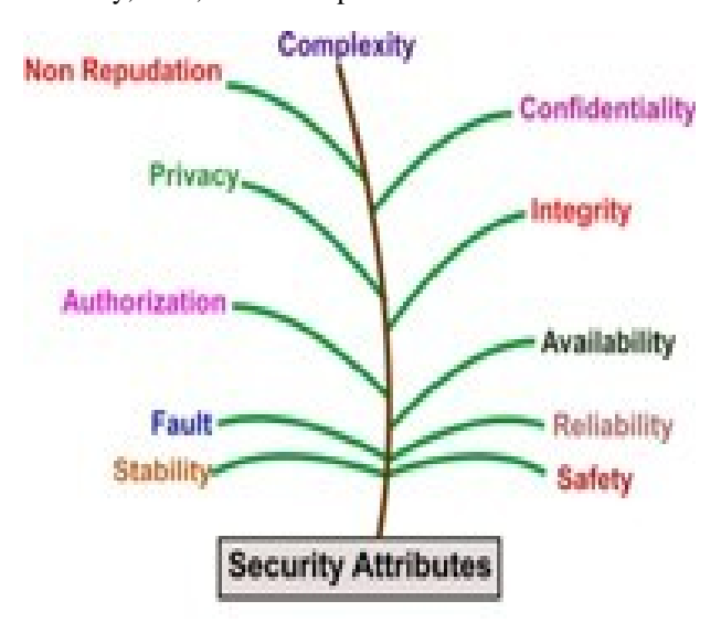
Figure 1. Security factors outlook

It relies on software attributes that how much system's software is protected; exactly the fault decides for how longer software will be protected. Fault is not only the factor that makes things hard to understand but with enough difficulty anything can become harder to understand. In this paper, we conduct a study regarding impact of fault to security estimation and their efficiency. There is need to develop a new approach to deal with a word of fault in software. Some other attributes of security is shown in figure 1. The required goal of security is to introduce measures and procedures that preserve confidentiality, integrity, availability, and other attributes such as authenticity, fault, and non-repudiation.